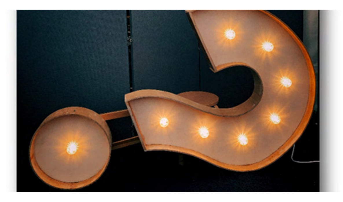
Please type your questions into the Q&A box.

If we don't get to your question, we will contact you after the webinar.